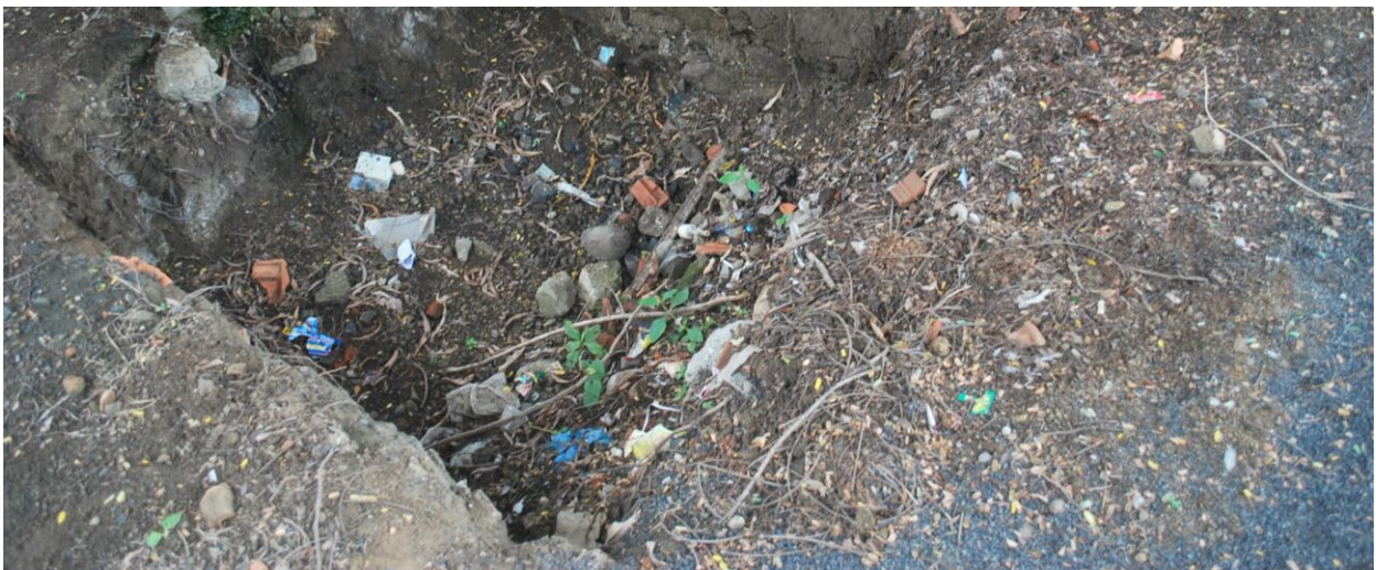
FIGURE 3 : COMPOST PIT