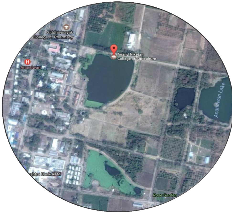
Figure 2: SATELLITE IMAGE OF ANANDNIKETAN COLLEGE WARORA CHANDRAPUR