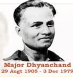
Major Dhyanchand 29 Augt 1905 - 3 Dec 1979